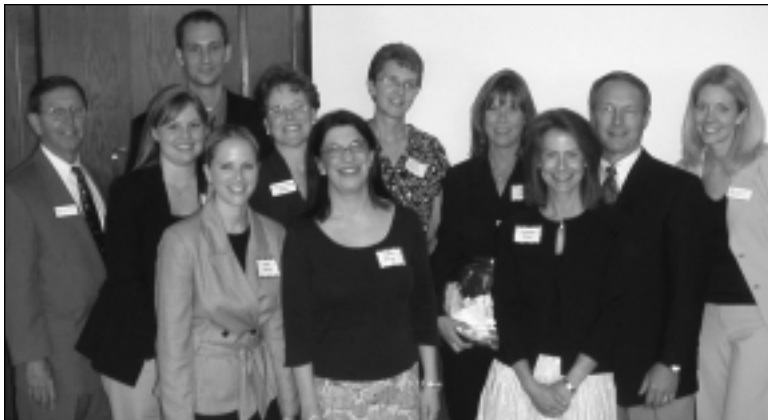
The Associated Audiologists staff poses for a photo together at the 20th anniversary celebration.