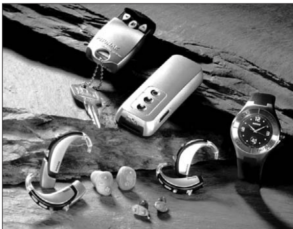
▲ The Savia from Phonak offers comprehensive selections for specific hearing losses, including optional remote control devices in the form of a keychain or watch.

Our mission is to continually educate our patients regarding the most-up-to-date technological advancements in hearing aids. The latest in the revolution of digital hearing instruments is the Savia from Phonak. The Savia features a tiny microcomputer that closely copies the biological process of hearing, leading to a more natural sound quality.